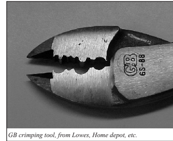
GB crimping tool, from Lowes, Home depot, etc.

EXTRA CIRCUITS: If you are not using the extra circuits (the purple or the green wires), either pull out the fuses or very carefully insulate these wires and tie them back out of the way.